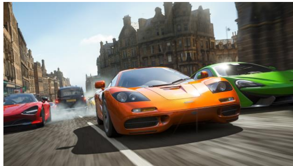
4 - learning about cars