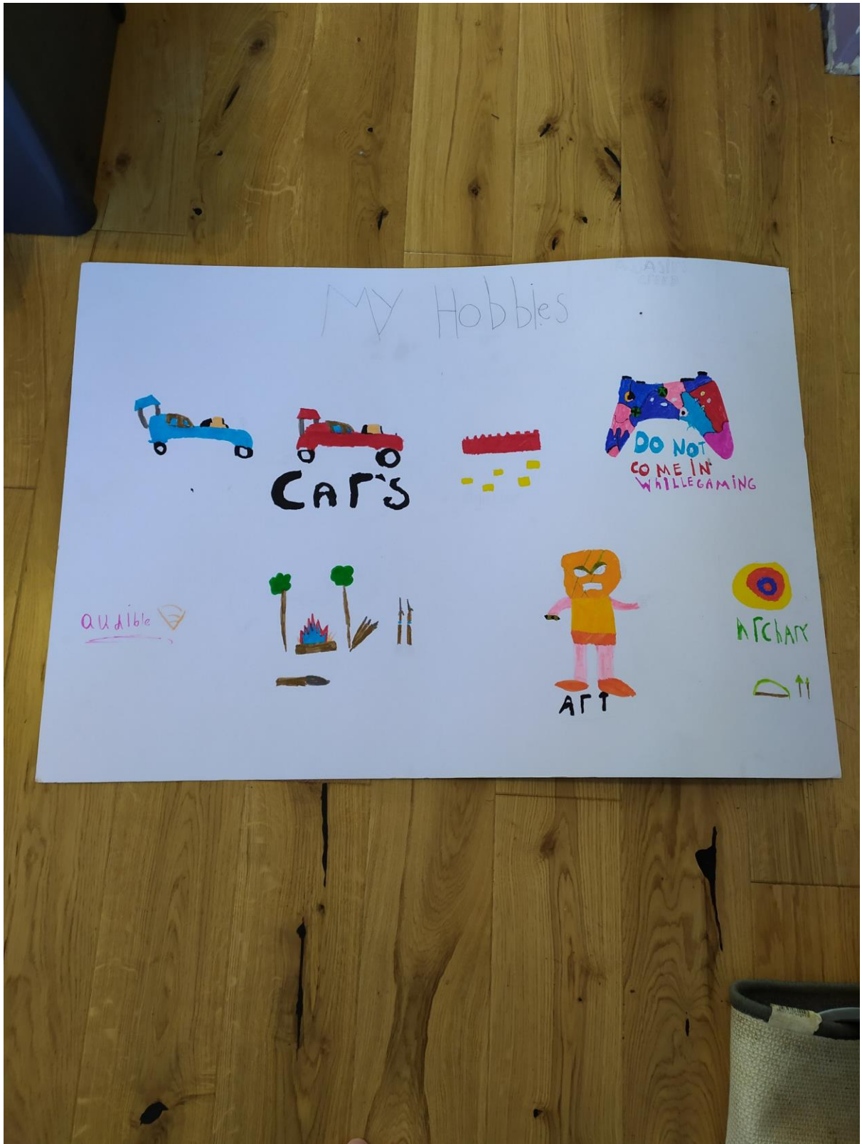
1 - My Visual board