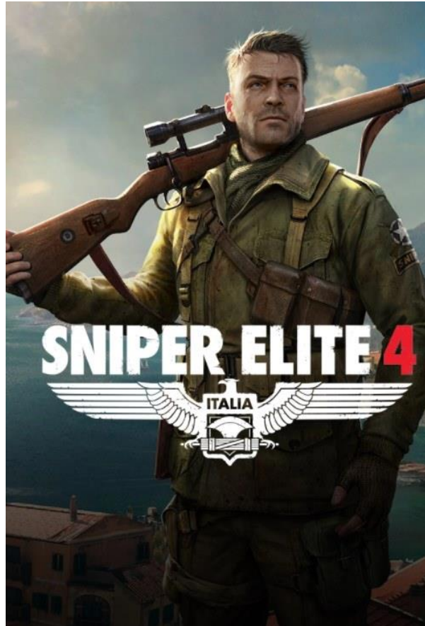
3 - Learning about World War II